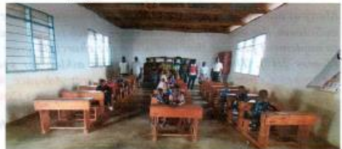
United Methodist Church and Orphans Preschool In Dar-Es Salaam

Although we have a number of projects listed in the Dar es Salaam Mission Center Master Plan, many of them have yet to be implemented. That's why we continue to talk about these projects and to solicit financial support from you, our donors. You have helped us finance some projects for which we are very grateful, but we still need your help for many other projects. Our Center Master Plan calls for the construction of a church, a health center, a primary and secondary school, a women's school and the addition of ten more rooms to the existing guest house, as well as a mini-bus for Preschool's children (added). For now, our priorities are more to build first a church, buy a Preschool mini-bus, build a health Center and then a Primary school. Hosting the 2023-2024 Annual Conference in our facilities will be very beneficial and add value to the work done, and will give a lot of visibility to the church and the mission center. Please, come in greater numbers to see the works. So, we think that if we receive enough financial donations from you, our partners, we'll make these projects a reality as do other missionaries here.