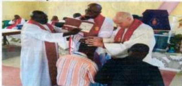
2023 Tanzania Annual Conference/Executive Committee Meeting

We are humbled through the mercies of our Lord Jesus, to thank you for your good willing, and your consistent prayers including your financial support. Accept here our heartfelt gratitude. Peace and Grace of God be with you.