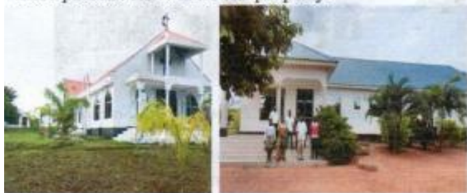
The UM Church Growth In Tanzania: Amazing church and Mission center Guest house

The majority of the children are orphans. The other children come from very poor and marginalized families; and these days, the preschools face many financial difficulties and challenges. One of the big problems we are facing is the lack of mini-buses to transport children to and from school as parents don't have the means of transportation. Another problem is the lack of money to pay salaries for the teachers and the workers, and for children food. We believe that having a mini-bus and funds to pay salaries will help these preschools to function properly.