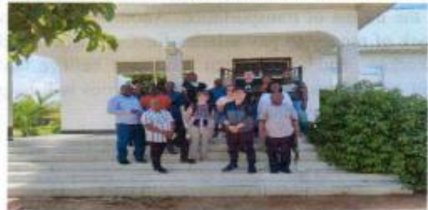
Mission Center's Master Plan, Dar Es Salaam