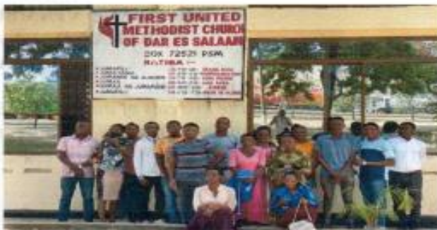
Roles Played by the Youths And Children In The Church

doing this, things will change and will be good for the church; because the people here want to see what the church is doing for them. So, we think that these three things will make the church growing, especially when the projects are accomplished, because most of these projects will create jobs and help people spiritually and financially.