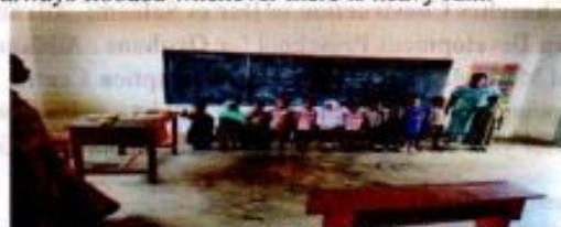
New Preschool opened At the Mission Center in Dar Es Salaam

The city is cosmopolitan and has one of the main ports used by Central and East African countries. The recent evangelism plan shows that we need to move from Dar es Salaam and plant new churches on the island of Zanzibar and in other places in the country. What we need is first to establish and equip the UMC in Dar es Salaam with good infrastructures and then go to the other places as well. We have a piece of land in Dar es Salaam (Mission Center) where we have already established a guest house, a kindergarten and a secondary school. We need funds to build a church in this center and later, with God's help, a health center, women school, Primary school and other projects as well. The workers and people of the community around the center need eagerly a building for worship, a place for them to pray and communicate with their God. This is also the case in many other places in the country where there are congregations but without shelters or church buildings. We hope that God will open doors for the Tanzania annual conference to build houses of the Lord where there are none, such as at the Mission Center, and also to renovate old buildings like Changombe in Dar es Salaam, which is always flooded whenever there is heavy rain.